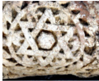
Star of David in Stone