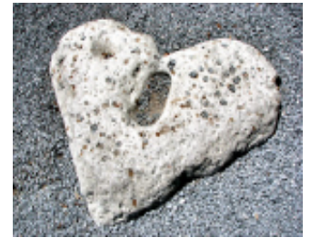
Heart of Stone