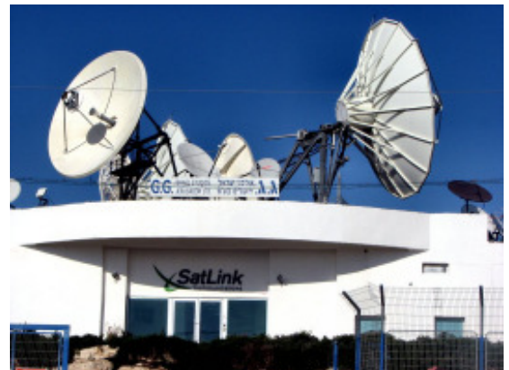
Sending out the "Good News"