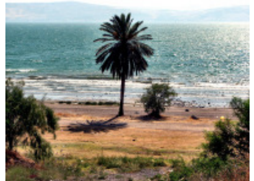
You Have Seen Well...

The word "perform" here in Hebrew is shaqad which means watching, awakened or being vigilant or hastening to bring the Word to pass. The linguistic connection here is very unique in that "waking" (shaqad) and "almond" (shaked) are almost identical. Thus the almond tree in Israel is considered the "waker" in Spring because it is the first tree to blossom even while snow is on the ground in the hilly areas around us near Jerusalem. This is a potent annual reminder that God is watching over His Word.